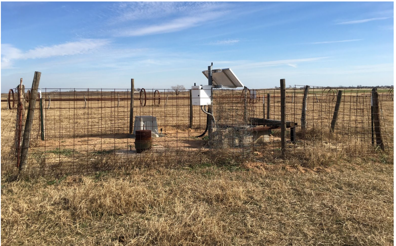
Figure 1. An Example of a seismic station in the TexNet network.