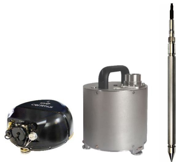
Figure 3. Certimus; Figure 4. 40T posthole; Figure 5. Radian posthole.

All data from the stations are streamed back to the TexNet data-centre at the Bureau of Economic Geology, where SeisComP is used for the real-time data analysis before being archived with IRIS.