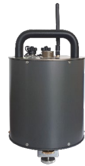
Figure 8. 6TD seismometer.

Six 6TD instruments form part of the rapid-deployment pool to provide flexibility and allow TexNet to deploy denser arrays around areas of particular interest. Minimus digitizers from the University of Texas Institute of Geophysics (UTIG) are also utilised as part of the network.