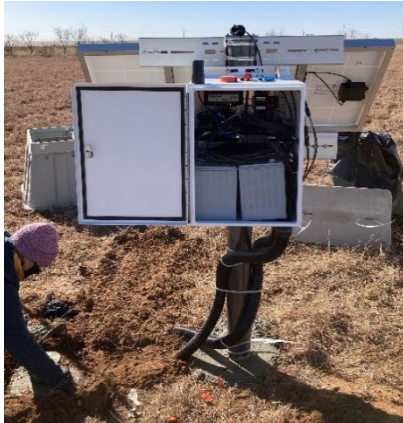
Figure 6. Example 40T posthole station, a solar panel powers the batteries.