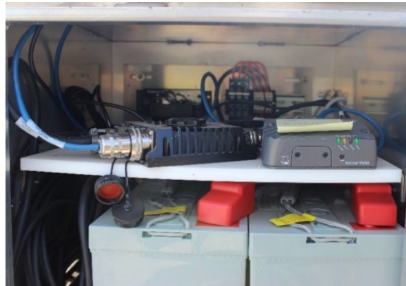
Figure 7. The secure cabinet houses the Minimus digitiser, the modem and the solar-powered batteries.