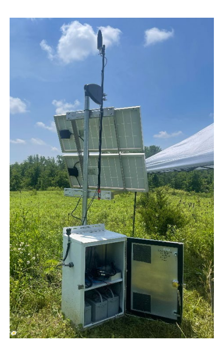
Figure 7. Stations are equipped with solar panel charged batteries to power the 40T Posthole and the Minimus digitiser, and with a cell modem to transmit the data to the network