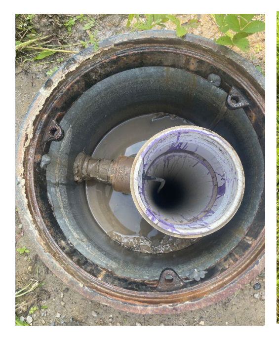
Figure 5. The 40T posthole instruments were deployed in cased holes to depths of down to 10 metres

The sensor vault was sealed with tarpaulin and covered in mulch to further protect against moisture ingress and weeds.