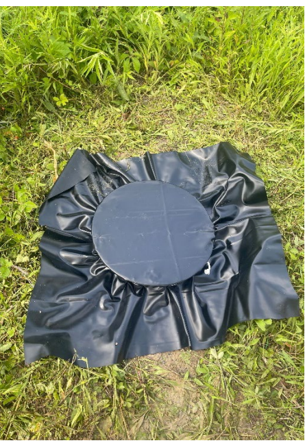
Figure 6. The cased holes were then sealed with tarpaulin and covered in mulch to protect against moisture ingress