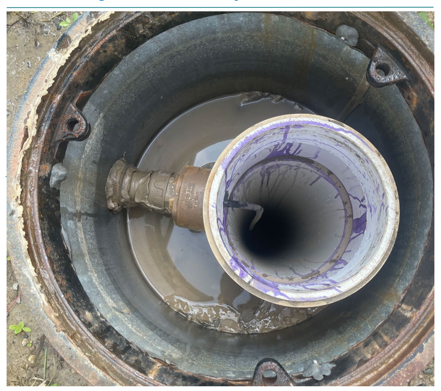
Figure 1. 40T Posthole instruments were deployed in cased holes to depths of up to 10 metres